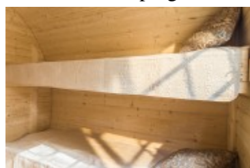
Single bed for Camping Pod Drawer under the bed