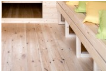
Bench for Camping Pod