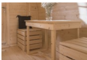
Table for Camping Pod