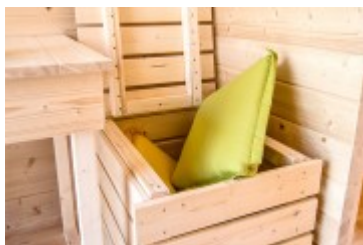
Pouf for Camping Pod