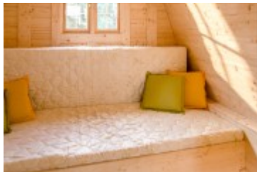
Double bed-sofa for Camping Pod Double bed 1400 x 2000 mm